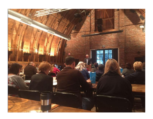
Registration coming soon!

We'll need some help putting this together, so keep an eye out for an email from seminar committee!